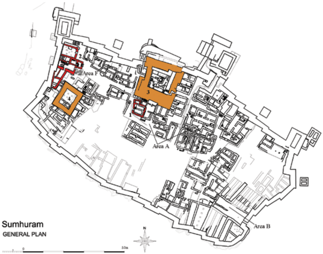
FIGURE 2. General plan of the city showing the different areas of excavation (Area A, B, F). 1: the urban shrine; 2: temple of Sīn; 3: so-called Monumental Building 1 (hosting the well); 4: so-called Monumental Building 2 (plan A. Massa and S. Rossi).

This stratigraphic and chronological sequence can be used as a reference for the general revision work of the other excavated areas still in progress. It also mirrors the broad phasing that has been more recently proposed for the city as a whole and confirms the recent re-assessment of the chronology made by Alessandra Avanzini (2014).